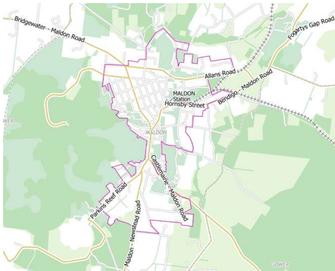
Figure 6: Project study area: Maldon

The study area (see figures 3 and 4 below) is all land located within the existing township boundaries of Maldon and Newstead.