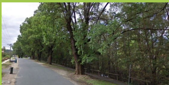
Gingell Street Avenue of Elms