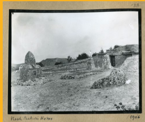
Castlemaine H84 Bushland Reserve: home of the 'Castlemaine Hermit'