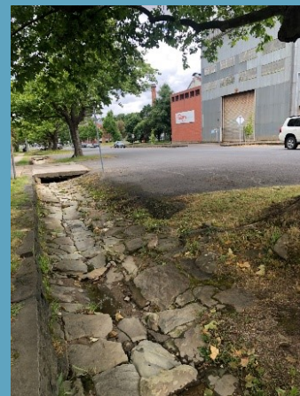
Parker Street stone drain